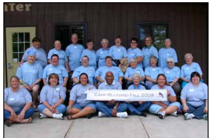
Campers and counselors at the fall session of Camp Bluebird at Camp Tecumseh.